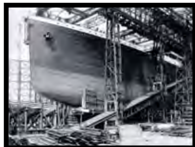
The ship measured 53 metres from the keel to the funnel tops.