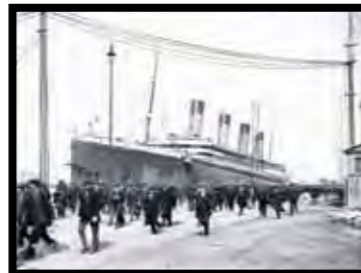
The Titanic weighed in at 45,000 kilos.