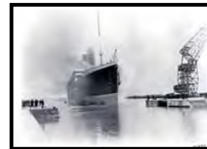
The biggest ship in the world leaving the docks.

At 41°43'32"N, 49°56'49"W, she is resting 3,840 metres below the surface. As it took another year to perfect the submarine technology for such an advanced expedition, the first human sighting was made the year after. To this day most of what has been salvaged is being shown at sold-out exhibitions around the world. And you can rest assured that you will hear more and more about exhibitions and Titanic memorabilia as we approach the centenary year in 2012.