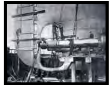
Top: The exclusive environments on the Titanic were all handmade. Above: One of three propeller shafts.